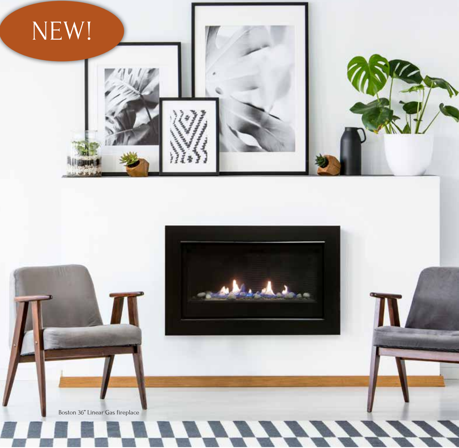
Boston 36" Linear Gas fireplace